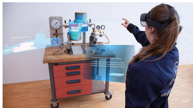
ViSTIS®: High AR fidelity promotes motivation and effective training

Being linked to the digital twin, training will keep up with configuration changes and upgrades.